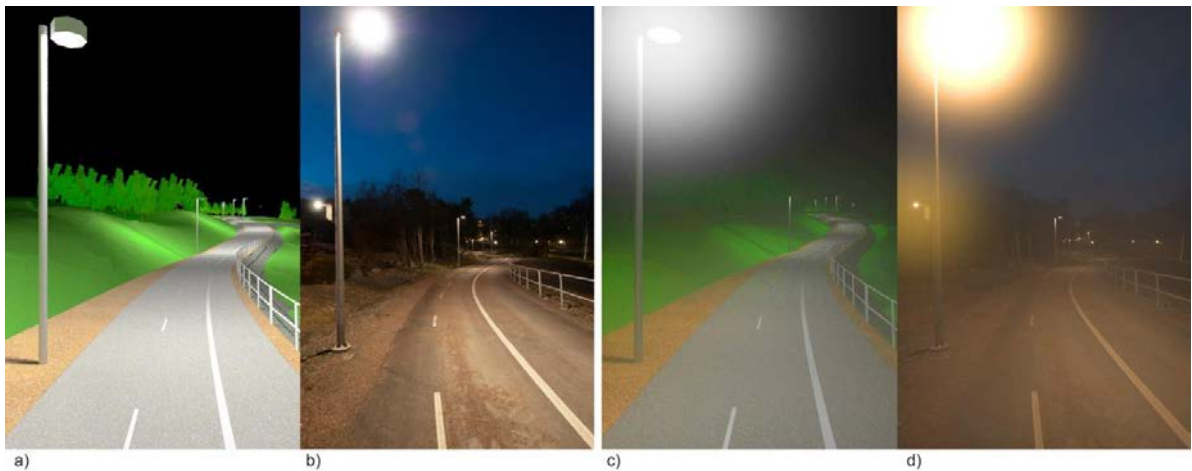
Fig. 2a) CAD model with light rendering of a pathway section. b) Real photo from the same location as in a. c-d) Visualization of contrast reduction due to veiling luminance of the scenes a and b.

The scene was a walkway with streetlights on poles. The development of the CAD model started with a 3D vector model of the ground topography taken from a geographic information system (GIS) database. This model was then processed in Sketchup Pro where material properties were added to the surfaces. This model was then transferred to Relux Pro where luminaires and other objects were added. The light rendering in Relux Pro uses both “raytracing” and “radiosity” techniques, which ensures that both reflected light from surfaces and direct light towards the observer are taken into account. The result is shown in Fig. 2a.