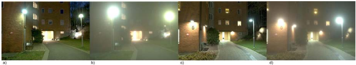
Fig 3a. Original lighting setting. b) Visualization of veiling luminance added to scene 3a. c) New lighting setting with less spill light and reduced risk for disability glare. d) Visualization of veiling luminance added to scene 3c.

In an outdoor lighting design study of a walkway outside an apartment building, we analysed the veiling luminance contribution in some scenes with simulations based on the eye model described in [10]. We found that the visibility was reduced to such an extent that some people might have problems to navigate. The lighting quality was improved by changing to luminaires that emitted less spill light and illuminated the ground more efficiently. These changes reduced the risk for disability glare which was proven by contrast measurements and glare simulations.